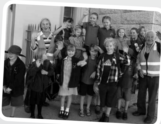
Walking School Bus walkers and volunteers

The Beechworth Walking School Bus Program now has 70 children registered. This means that almost a quarter (24%) of primary school aged children in Beechworth are accessing the program.